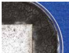
Others without Microban protection

*Warranty applies to residential applications only. For terms, conditions and exclusions, see full warranty at alliedair.com .