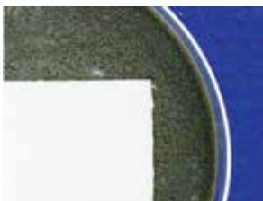
AirEase with Microban protection

Enjoy cleaner air with Microban-infused drain pans that inhibit the growth of mold and mildew, making your home a healthier environment year after year.